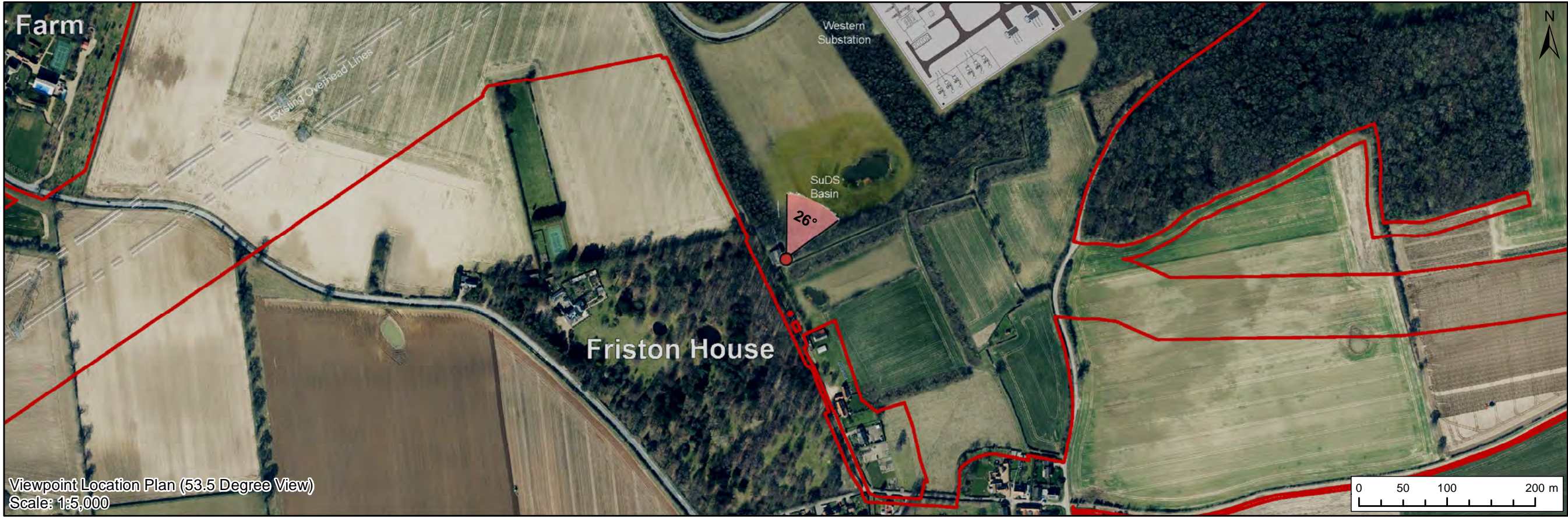
Viewpoint Location Plan (53.5 Degree View) Scale: 1:5,000