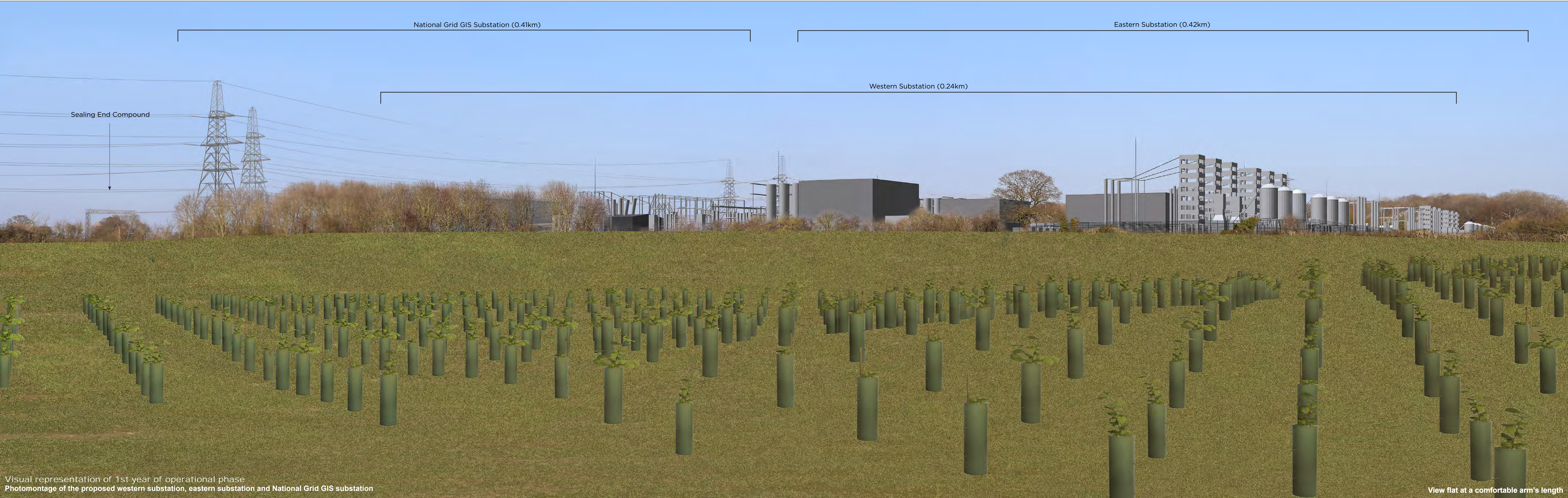
Visual representation of 1st year of operational phase Photomontage of the proposed western substation, eastern substation and National Grid GIS substation