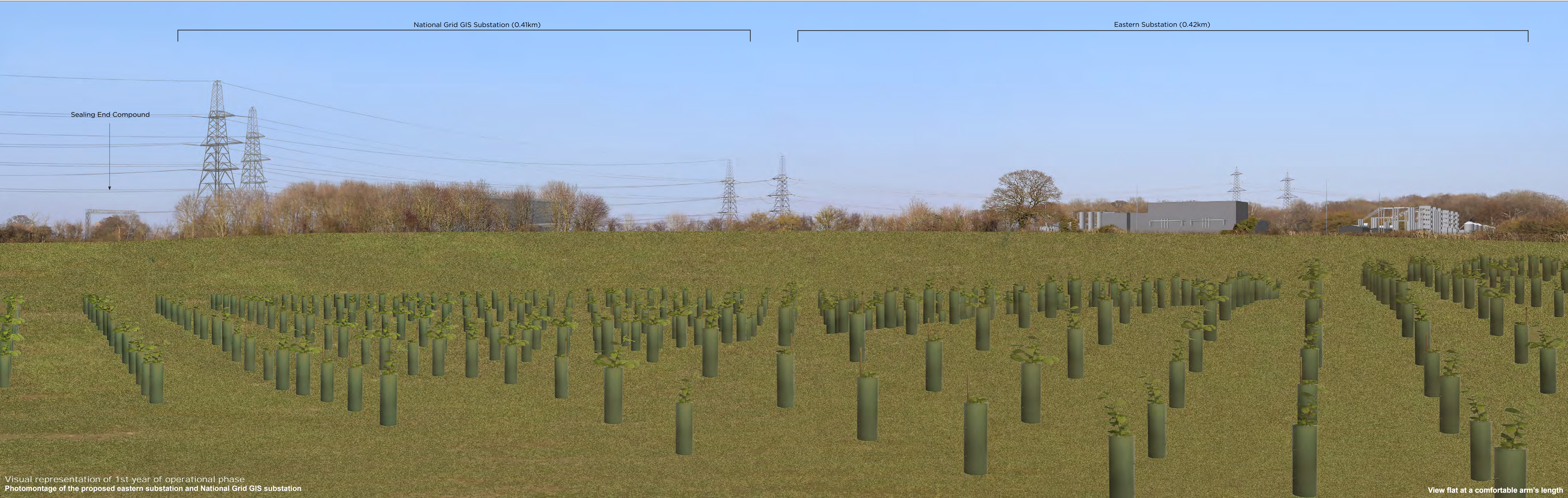
Visual representation of 1st year of operational phase Photomontage of the proposed eastern substation and National Grid GIS substation